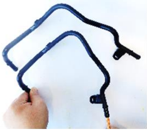
Pic. 1: PA6.6 GF30 (high form stability) compared to flexible material